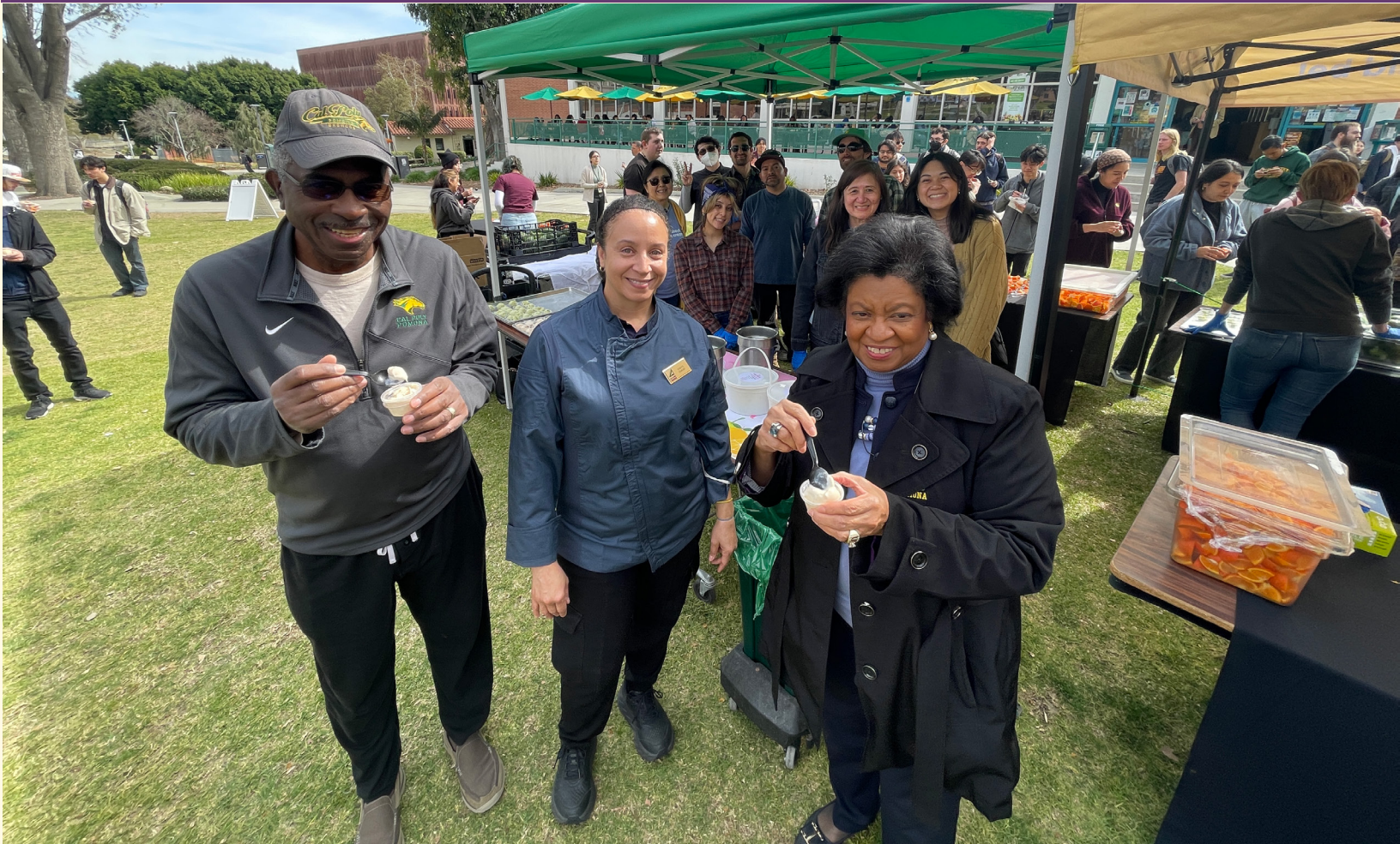
CPP Ice Cream Sampling! Read more on pages 9-10